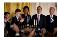
Joining Wilmer, Questions Governor and Governor in the Literary World, Larami (a)malvin.com

Featured Slideshow The photo was posted as damage control after the pop star tweeted — and then eight minutes later deleted — the hashtag #FreePalestine. That initial tweet provoked an immediate barrage from Israeli advocates on Twitter asking if she supported Hamas. It's not clear to what degree the photo mollified her critics. But what Rihanna didn't know was that the photo is actually a fake.